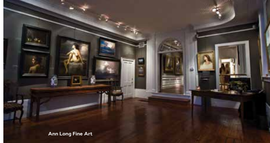
Ann Long Fine Art