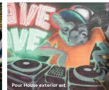
Pour House exterior art