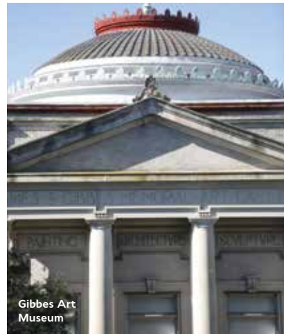
Gibbes Art Museum

Last, they're totally rethinking the Gibbes Art Museum ( gibbesmuseum.org ), which is undergoing a complete renovation and is set to reopen in spring of 2016. The first floor will be free to the public, with a new cafe, courtyard, and classroom space. The whole second level, which will showcase the permanent collection, is being redesigned, with better flow and room for more works to be on display. And the third floor will have the special and traveling exhibitions."