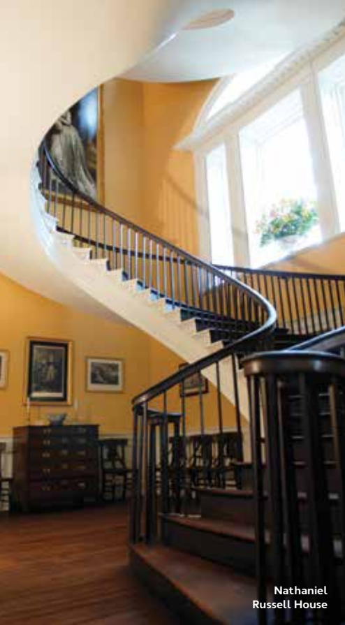
Nathaniel Russell House