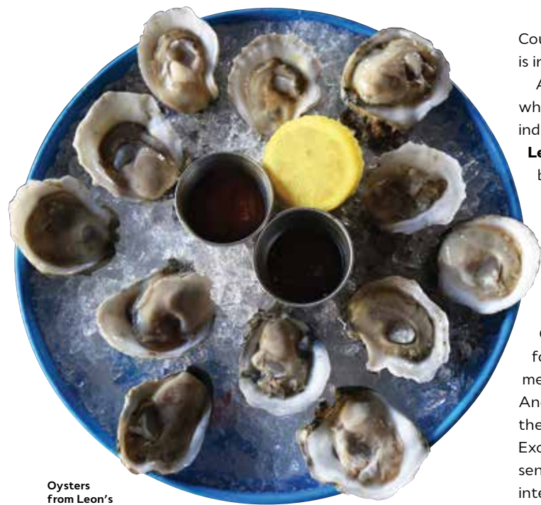
Oysters from Leon's

Country chefs; the shrimp and grits is ironclad.