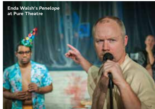
Enda Walsh's Penelope at Pure Theatre