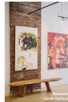
Rebekah Jacob Gallery

Centering the small sea of modern art on Upper King is the Rebekah Jacob Gallery ( rebekahjacobgallery.com ). The gallery represents a national stable of first-rate painters, sculptors, and photographers. There are few experiences more exciting than seeing new works in the paint-spattered spaces where they were conceived. At nearby Redux ( reduxstudios.org ), Charleston's loft-like incubator of young, up-and-coming artists, monthly exhibitions, courses in painting and printmaking, and a dozen studios await."