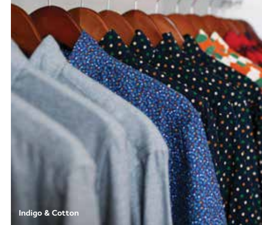
Indigo & Cotton

And all eyes are on the forty-one-room Spectator Hotel ( spectatorhotel.com ), which is scheduled to open in spring of 2015. The boutique prop-